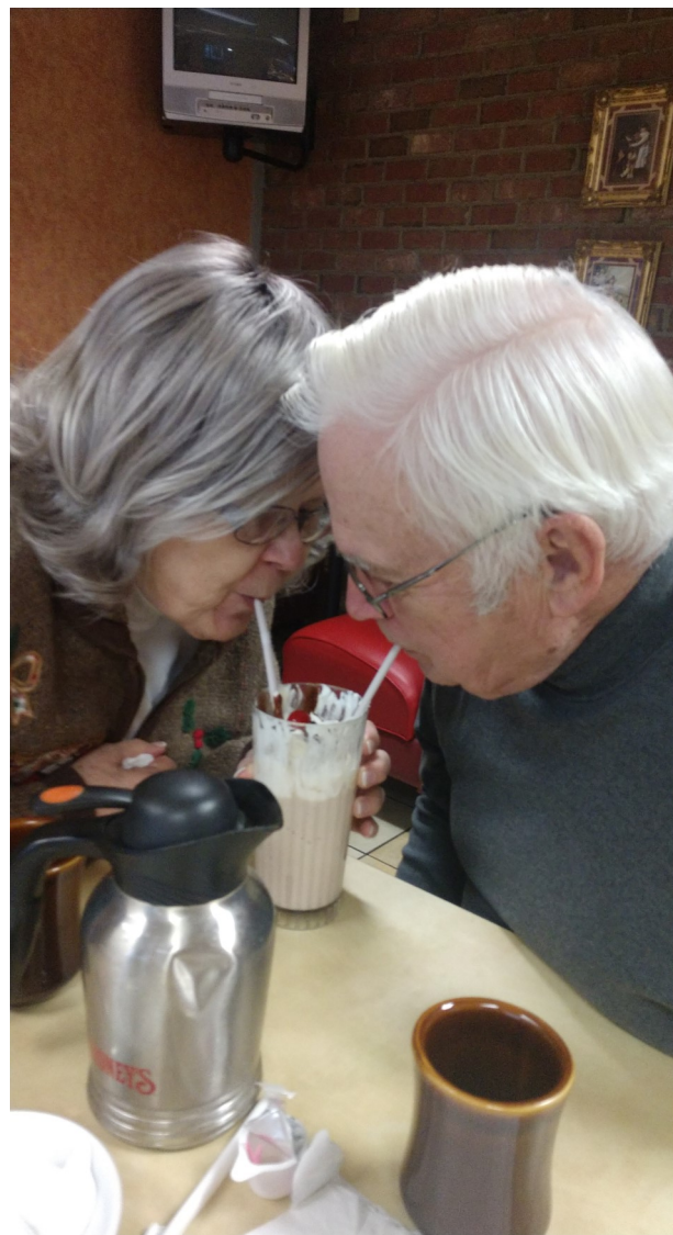
NMRA Plateau Division Superintendent demonstrates celebrating our Division Christmas Brunch on December 13, 2021 with his lovely wife.