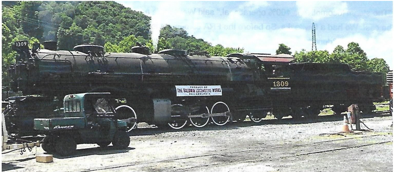
Smoke billows from the Western Maryland Scenic Railroad's Baldwin locomotive No. 1309 on June 29, 2020. Railroad officials said that the engine is operational.

CUMBERLAND - Officials with the Western Maryland Scenic Railroad say the massive Baldwin steam engine No. 1309 is fully operational and are confident the locomotive can be cleared for duty this summer.