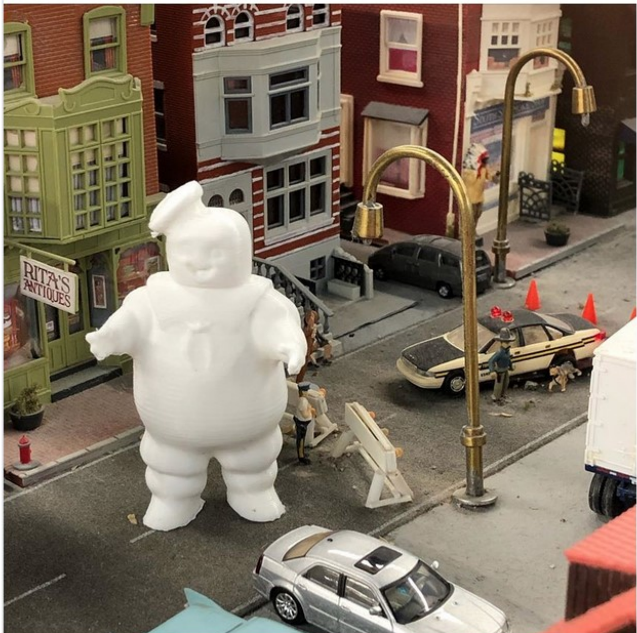
Who you gonna call (HO Jim A.) GhostBusters

Locomotive Repair Law Number 13 If you can see the problem, it can be fixed quickly. If you can only hear the problem, it will be a more involved repair. If you can't see or hear the problem, the fix will be lengthy and expensive.